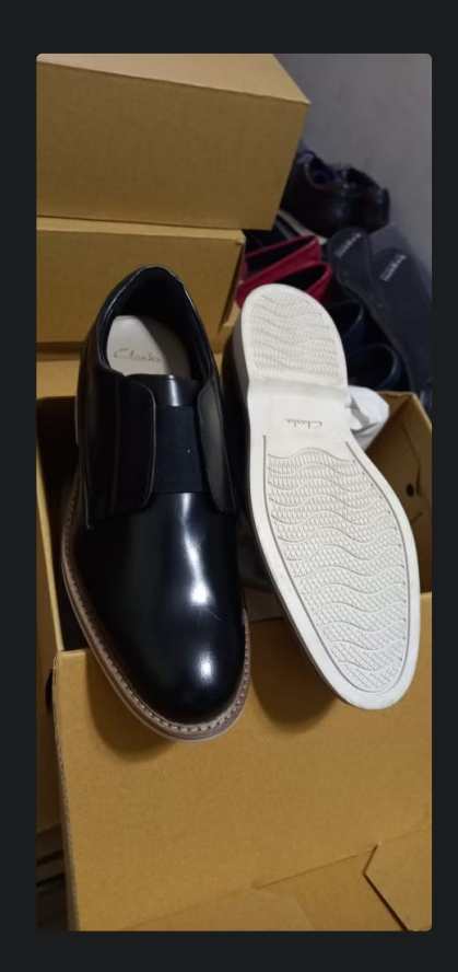
Slip On Black Formal Shoes (Men)