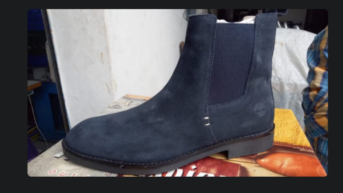
Navy Blue Suede Flat Boots (Men)