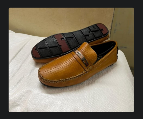
Casual Leather Loafers (Men)