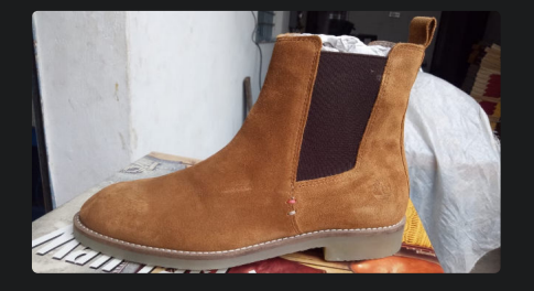
Suede Leather Chelsea Boots (Men)