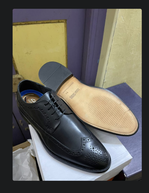
Textured Leather Formal Brogues -Black (Men)