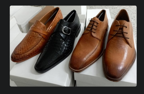
Formal Shoes (Men)