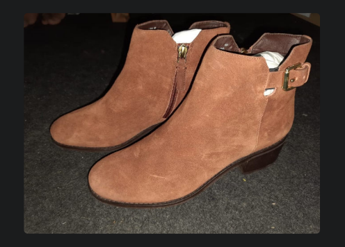
Buckle Suede Leather Booties (Women)