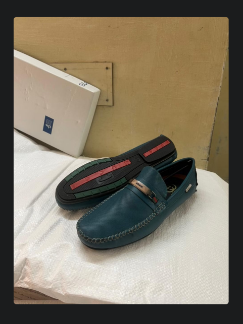
Russian Blue Leather Loafers (Men)