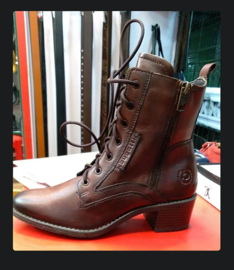
Designer Heeled Lace Boots (Women)