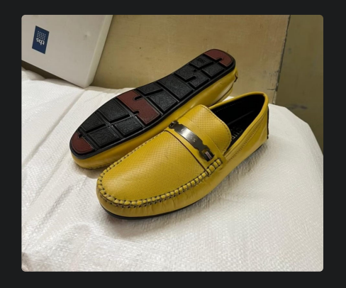
Textured Slip-On Loafers With Metal Accent