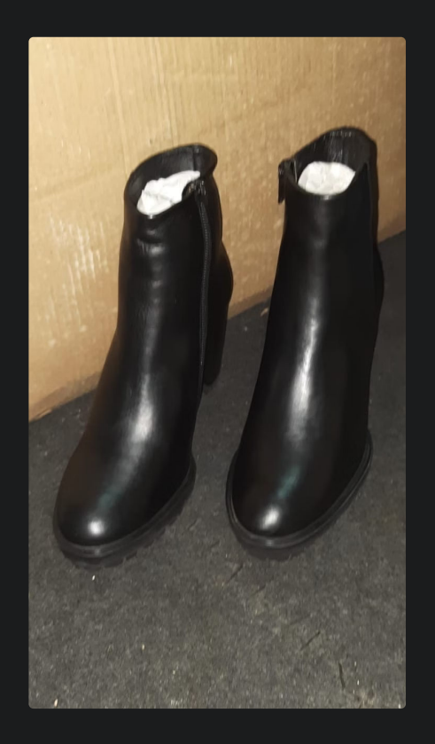
Ankle Boots - Zip (Women)