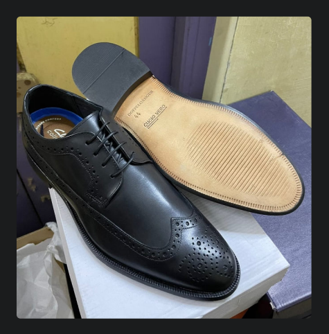
Formal Leather Brogues Black (Men)