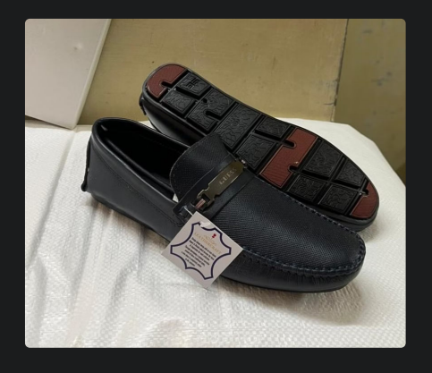
Textured Round Toe Loafers (Men)