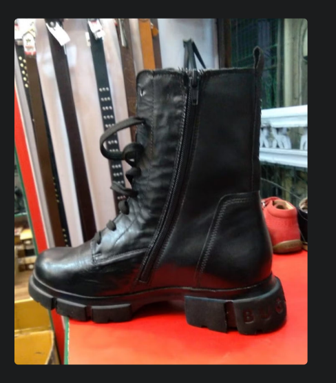
Genuine Leather Lace Up Platform Sole Boots (Women)