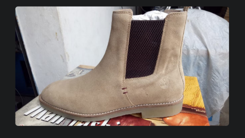
Suede Leather Chelsea Boots (Men)