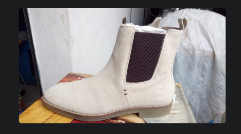
Suede Leather Chelboots (Men)