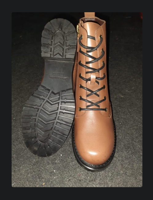
Lace Up Ankle Boots (Women)