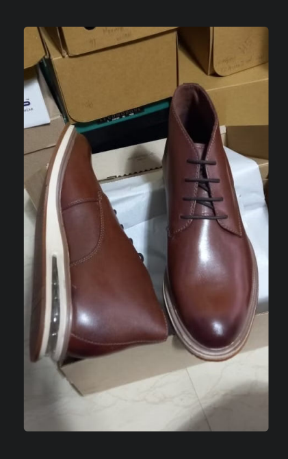
Malwood Mid Dark Tan Leather Boots (Men)