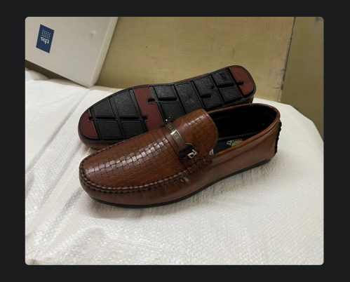
Mid Dark Tan Croco Textured Loafers (Men)