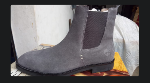
Slip - ons Chelse Suede Leather Boots (Men)