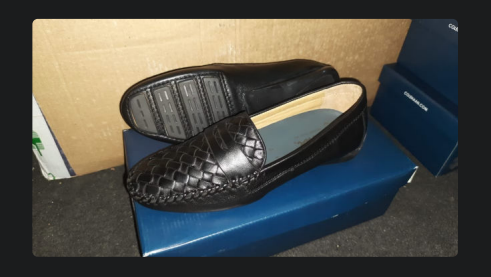
Black Apron Leather Loafers (Men)