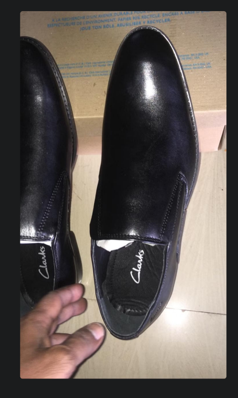
Genuine Leather Formal Slip Ons Shoes (Men)