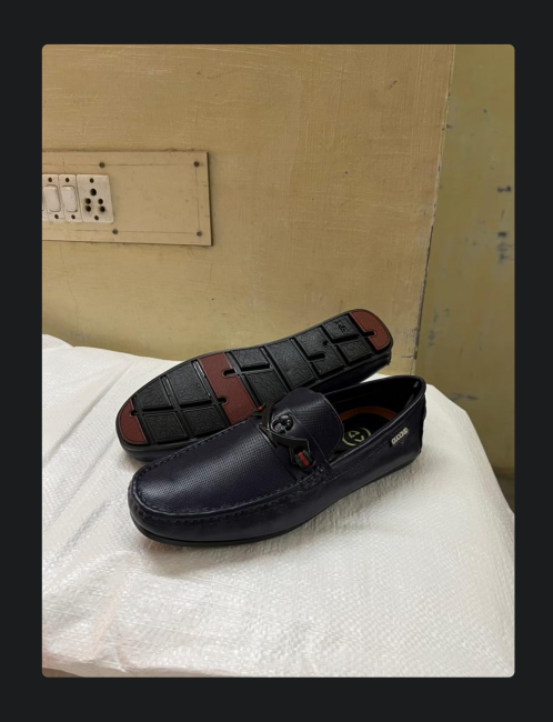
Slip-On Loafers (Men)