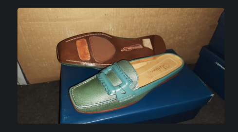
Soft Leather Mules -(Women)