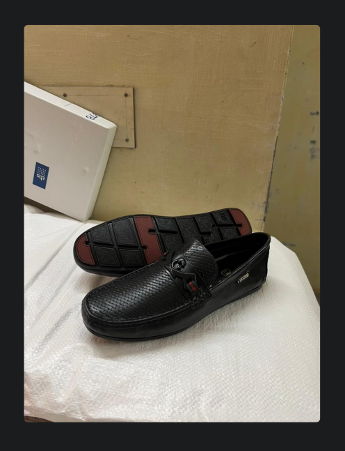
Black Leather Slip-On Loafer Shoes (Men)