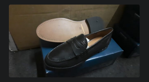
Plain Shoes -Loafers (Men)