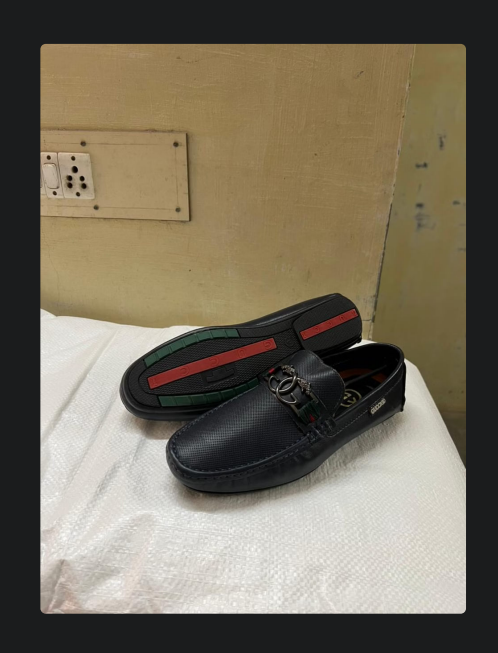
Black Leather Loafers (Men)